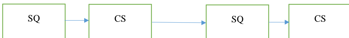
Figure 1. CS (C) and SQ

So author intends to test the following hypotheses